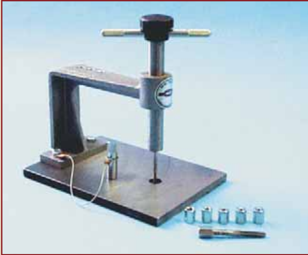
8200-001 Model 790 Mini-Tapper