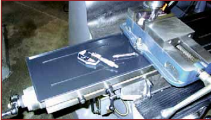
Table Guard & Tote